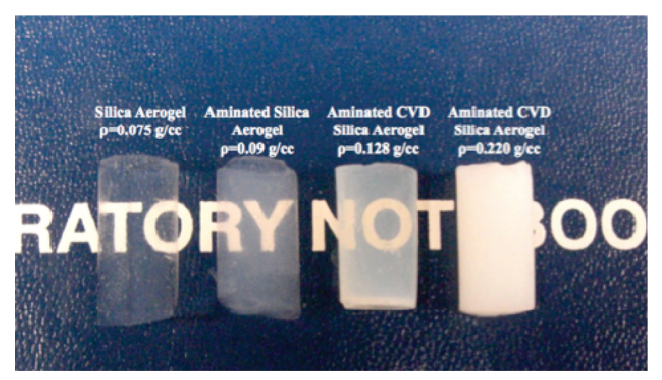
FIGURE 1. Transparent silica aerogel and aminated silica aerogel. After CVD of methyl cyanoacrylate, the gels begin to become opaque.

10 kPa with an elastic modulus of 65 kPa, a fraction of that measured for nonporous amorphous silica (55 MPa and 73 GPa, respectively) (10). Any strategy to strengthen aerogels must reinforce the necks in the network while keeping the high surface area, pore volume, and low density. Early strategies relied on redistribution of silica from the particles to the necks in alkaline solutions (Ostwald ripening) (11). Supplying additional monomer after gelation has also been reported to strengthen gels (12). More recently, chemical vapor deposition (CVD) of silyl chlorides or metal halides has been used to reinforce aerogels quickly, although the modest increases in strength may be due to modification of the surface chemistry (13). This CVD was achieved despite slower gas diffusion within the silica aerogel compared to free space (14). Addition-